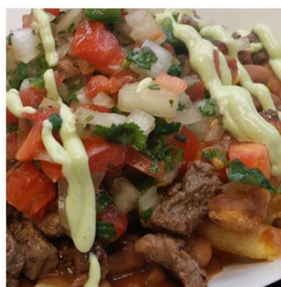
CARNE ASADA FRIES