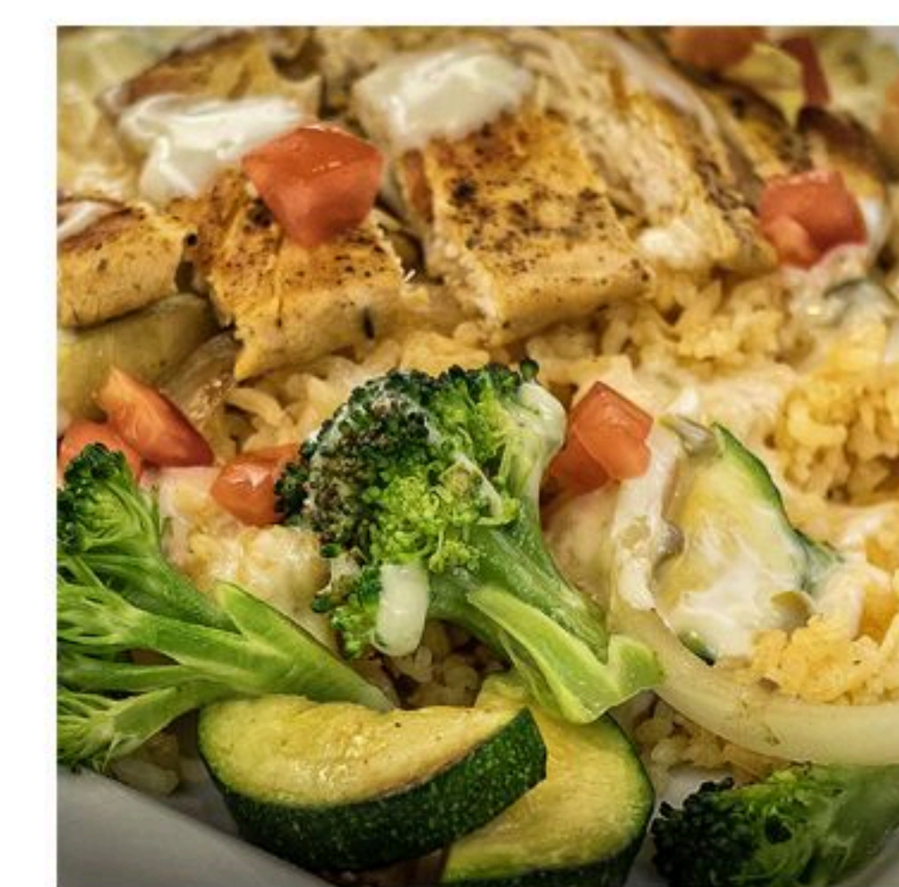
ARROZ CON POLLO